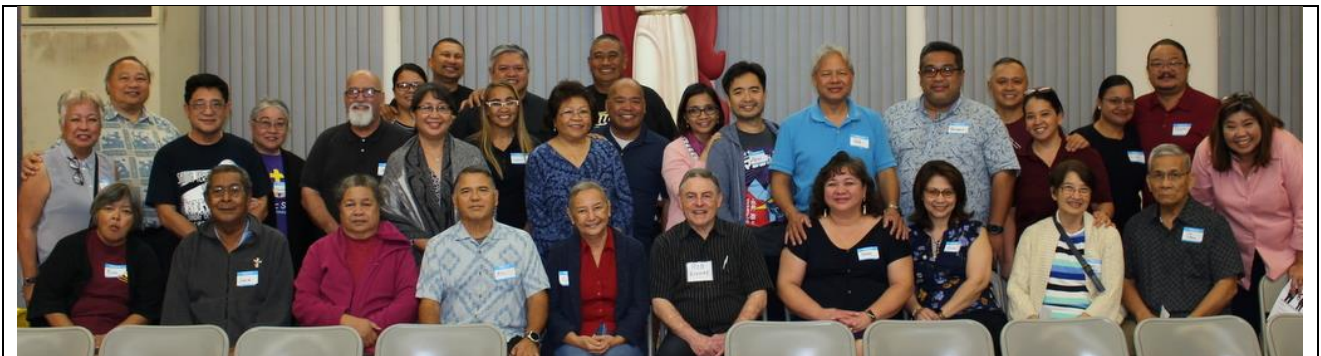
The meeting for Experienced Sponsor Couples. Some were from original training in 1977.

The next day we had a meeting for Experienced Sponsor Couples . This was a delightful gathering that included some couples we took part in the first Training I directed in Guam in 1977.