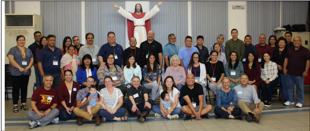
Training Day for new sponsor couples.

On Saturday we had a Training for new Sponsor Couples . There were 18 new couples and a number of experienced couples who helped with the training. I think I have never had so much help during a training session. As usual the experienced sponsor couples are wonderfully effective in sharing the reality of Matrimony and motivating the new couples to believe they CAN DO this ministry.